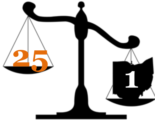
Share of Post-Convention Campaign Visits, 2008