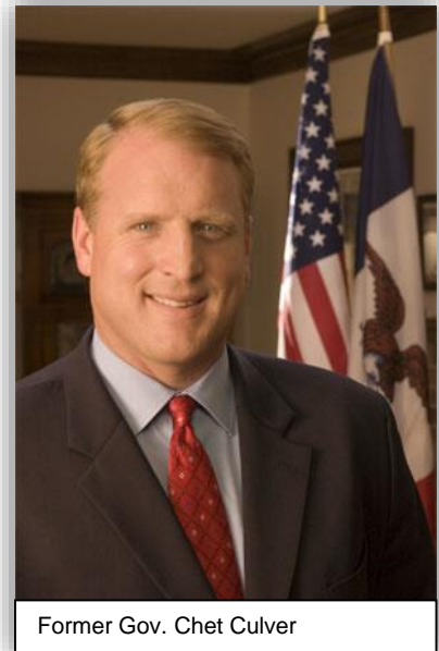
Former Gov. Chet Culver

- Former Gov. Chet Culver , Iowa, at a news conference May 12, 2011